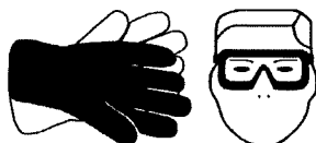
Person Protective Equipment Pictograms:

Hygiene measures: Ensure the application of strict rules of hygiene by the personnel exposed to the risk of contact with the product. Regular cleaning of equipment, work area and clothing is recommended. Wash hands before breaks and immediately after handling the product. Do not use abrasives, solvents or fuels. Do not dry hands with rags that have been contaminated with product. Do not put product contaminated rags into workwear pockets.